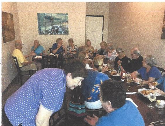
Dinner with Democrats at Bella Cucina August 26!