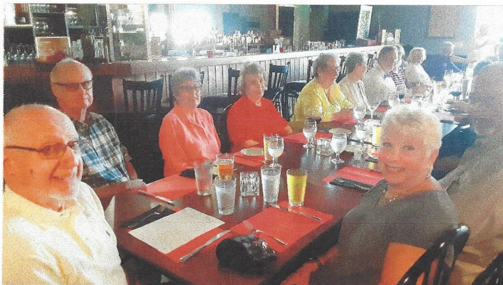
Dinner with Democrats on May 27th at Graze Restaurant

It sure was great to see everyone at Dinner for Democrats on Thursday, May 27th! 23 club members attended the dinner at Graze Restaurant.