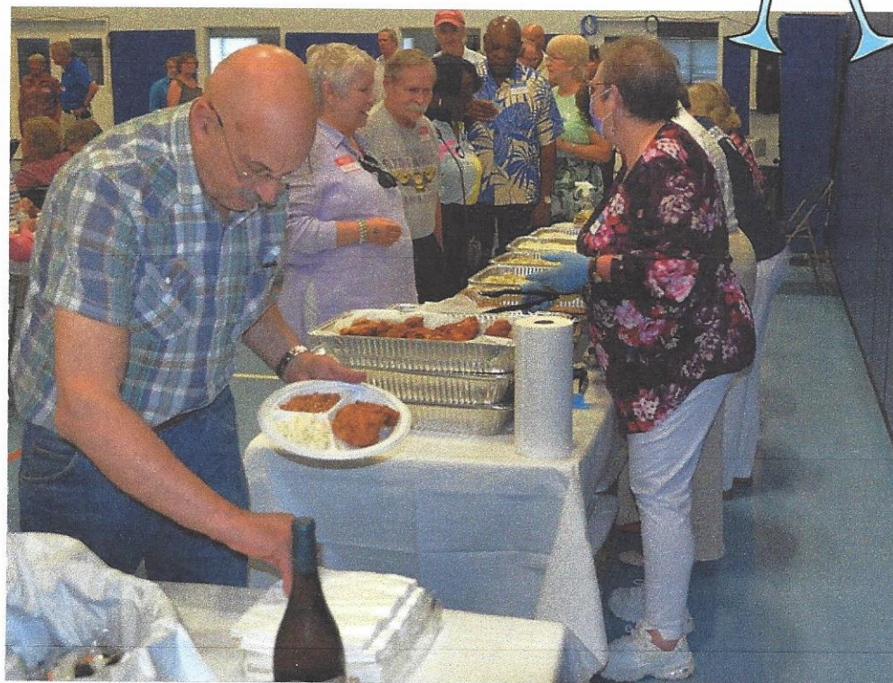
Over 60 people attended our Club Picnic June 19th!